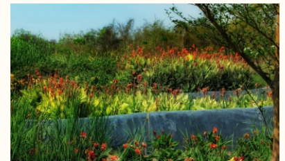
Hyderabad Central University