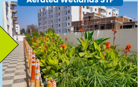
150 KLD STP set up right next to Bedrooms & Balconies

We aim to integrate purification system into a beautiful landscape plan