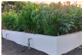
Bhuj Railway Station