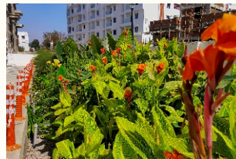
NCD - Vivanta