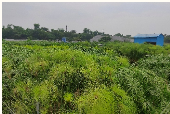
Kanha Shanti Vanam